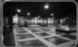
FREE STYLE TRAMPOLINE COURT

THE WORLD'S LARGEST INDOOR TRAMPOLINE FUN PARKS