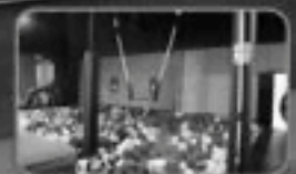
TRAPEZE & FORM PIT