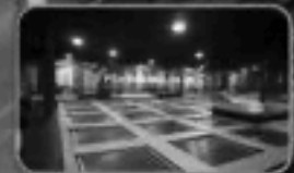
FREE STYLE TRAMPOLINE COURT

411 S. Main St-moscowchamber.com-(208)882-1800